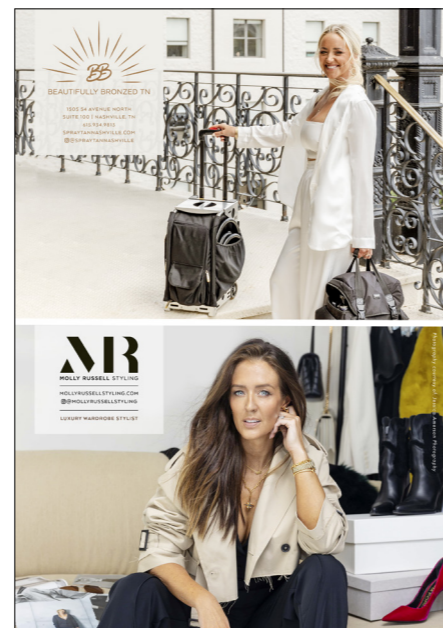
HALF PAGE SPREAD